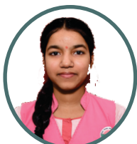
NATASHA 97.5 %