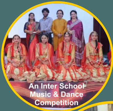
An Inter School Music & Dance Competition