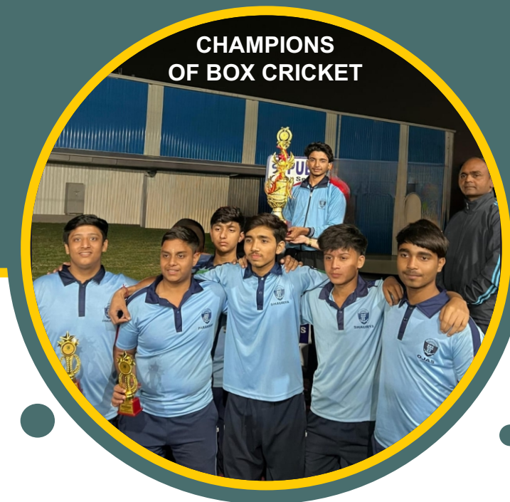
CHAMPIONS OF BOX CRICKET

An English Medium Senior Secondary School